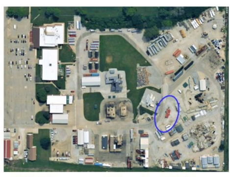
IFSI Fireground showing FES prop